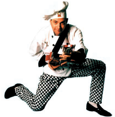
The Rock & Roll Chef®

Ever notice how, at so many parties, everyone ends up in the kitchen, watching the food being made, tasting the dishes before they're plated, drawn to the heart of the home? Our show speaks to this natural attraction, with one major difference: We add great live music to the blend.